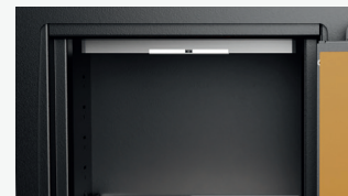
Automatic LED lighting