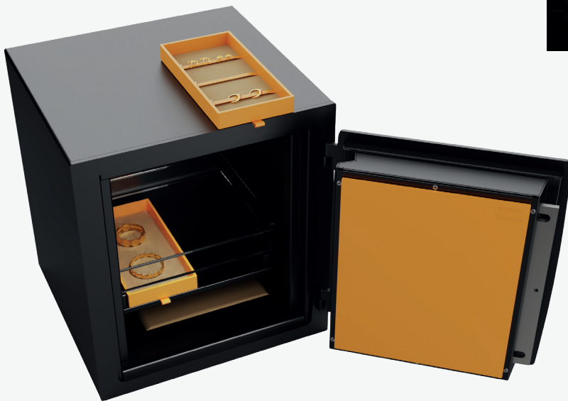
Removable drawers to deposit/withdraw jewellery items with ease Glass shelf allowing for quick visual identification of contents