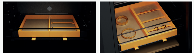
Standard drawer and special drawer with bars for rings and earrings