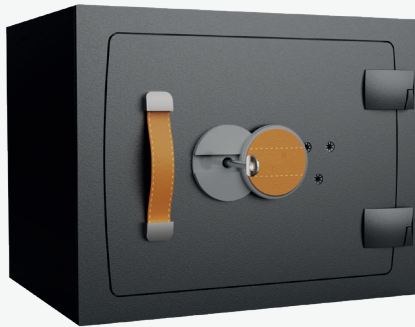
Complice Style 20