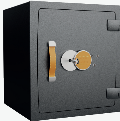
Complice Style 40