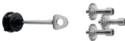
MpX mechanical key lock +3 cylinders

With 200 years of experience as master locksmiths, we develop and manufacture our own exclusive locks. This is one of the key strengths of our safes and a guarantee of high security. We remain committed to permanent investment in R&D, always looking for more functionality, more resistance, new materials and more advanced lock technologies.