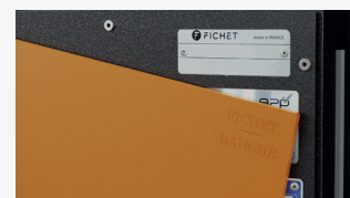
Magnetic plate to access ID labels and cylinders