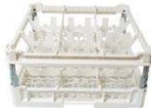
KIT 3 3x3

Rack size: 500x500 mm Glass height: From 120 to 240 mm Compartments size: 146x146 mm