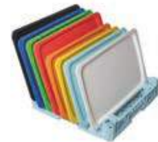
Rack with open side for 8 trays Gastronorm/Euronorm