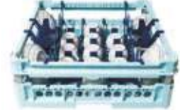
Rack for 17 tea cups and plates