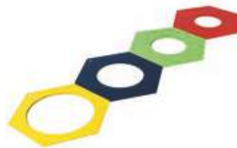
Manual measurement for glass diameter

Code: 100100 Yellow: rack 4x4 Blue: rack 5x5 Green: rack 6x6 Red: rack 7x7