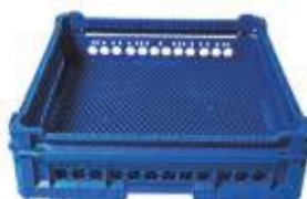
Narrow mesh rack with protective frame