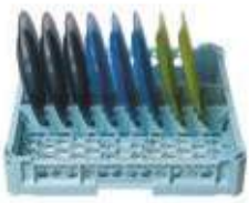
Rack for 8 big plates