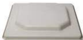
Lid for racks

Code: 100100 Yellow: rack 4x4 Blue: rack 5x5 Green: rack 6x6 Red: rack 7x7