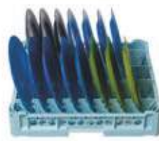
Rack for 15 average and soup plates