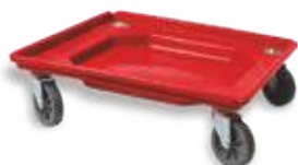
Cart for racks with drip tray

Code: CA500 Size: 550x550 mm Unit weight: 2,60 Kg. Load capacity: 140 kg