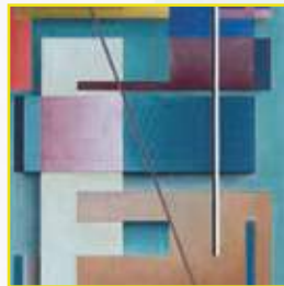
[1935, Composition , Manlio Rho ]