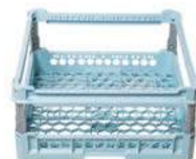
Large mesh rack with high protective frame