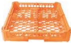
KIT 1 2x2

Rack size: 500x500 mm Glass height: From 0 to 65 mm Compartments size: 226x226 mm