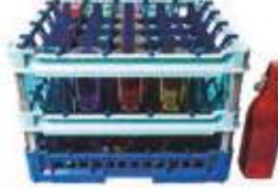
Rack for 25 bottles of 100 cl