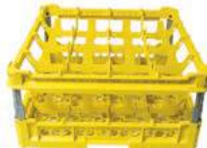
KIT 3 4x4

Rack size: 500x500 mm Glass height: From 120 to 240 mm Compartments size: 113x113 mm