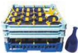
Rack for 16 bottles of 75 cl