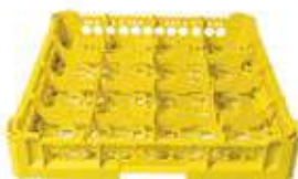
KIT 1 4x4

Rack size: 500x500 mm Glass height: From 0 to 65 mm Compartments size: 113x113 mm