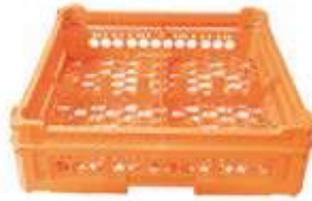
KIT 2 2x2

Rack size: 500x500 mm Glass height: From 65 to 120 mm Compartments size: 226x226 mm