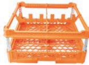
KIT 3 2x2

Rack size: 500x500 mm Glass height: From 120 to 240 mm Compartments size: 226x226 mm