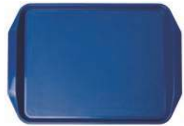
Fast-food With handle

Code: 100003 External size: 345x270 mm Internal size: 305x230 mm Box unit weight: 10 Kg Packaging: 50 pcs