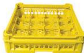
KIT 2 4x4

Rack size: 500x500 mm Glass height: From 65 to 120 mm Compartments size: 113x113 mm