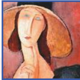
[1918, Jeanne Hébuterne with hat , Amedeo Modigliani ]