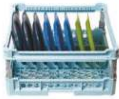
Rack for 8 big plates with protective frame