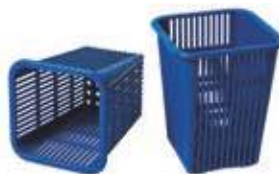
Cutlery single basket