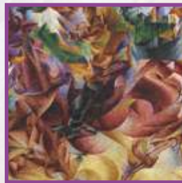
[1912, Elasticity , Umberto Boccioni ]