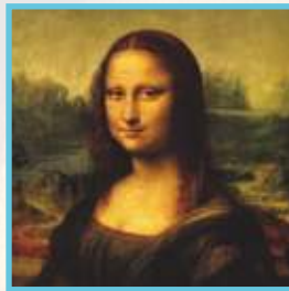
[1503-1505, Portrait of Mona Lisa , Leonardo Da Vinci ]