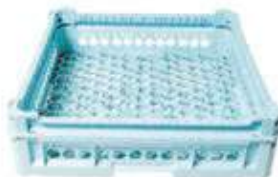
Large mesh rack with protective frame