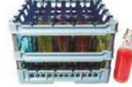
Rack for 25 bottles of 100 cl with conveyors