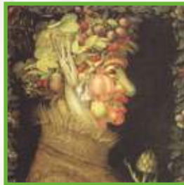
[1573, Summer , Giuseppe Arcimboldo ]