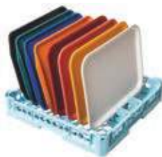
Rack for 8 fast-food trays