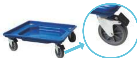
Cart for racks with drip tray and brake

Code: CA500 Size: 550x550 mm Unit weight: 2,60 Kg. Load capacity: 140 kg