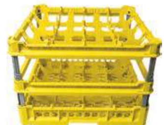
KIT 4 4x4

Rack size: 500x500 mm Glass height: From 240 to 340 mm Compartments size: 113x113 mm