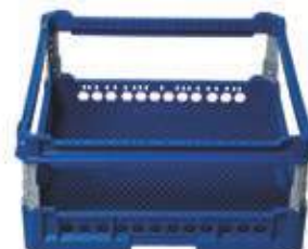
Narrow mesh rack with high protective frame