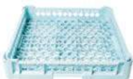
Large mesh rack