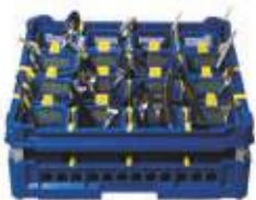
Rack with 16 cutlery baskets