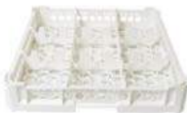
KIT 1 3x3

Rack size: 500x500 mm Glass height: From 0 to 65 mm Compartments size: 146x146 mm