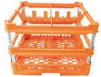
KIT 4 2x2

Rack size: 500x500 mm Glass height: From 240 to 340 mm Compartments size: 226x226 mm