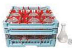
Rack for 9 bottles of 127 cl