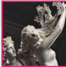
[1622-1625, Apollo and Daphne , Gian Lorenzo Bernini ]