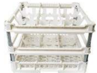
KIT 4 3x3

Rack size: 500x500 mm Glass height: From 240 to 340 mm Compartments size: 146x146 mm