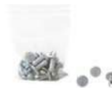
Pins for adjusting the height of the racks