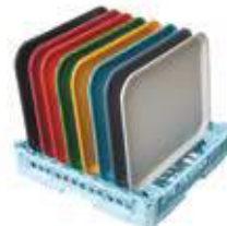
Rack for 8 cafeteria trays