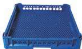
Narrow mesh rack