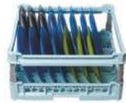
Rack for 15 average and soup plates with protective frame