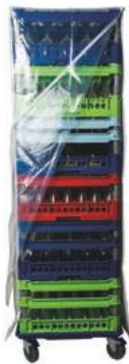
Plastic rack cover