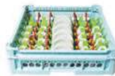
Rack for 28 coffee cups and plates