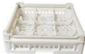
KIT 2 3x3

Rack size: 500x500 mm Glass height: From 65 to 120 mm Compartments size: 146x146 mm