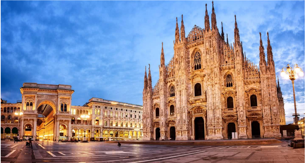
Duomo Square in Milan

You will continue your tour in Milan, have a walk in the city centre with your guide to visit Piazza Duomo, Piazza della Scala, the Castello Sforzesco and afterwards the opportunity to do some shopping in one of most fashionable cities in the world!