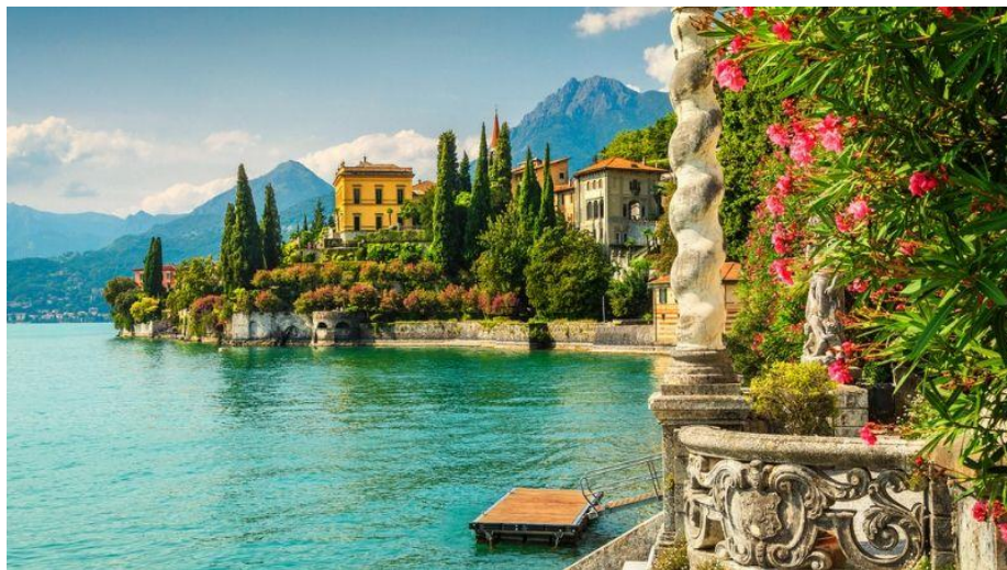
A view of Como lake

Then we will reach the famous Como lake, poised in the shadow of the snowdraped Rhaetian Alps and nestled between steep wooded hills. Its magic atmosphere will welcome you open arms. There you'll visit Como city centre and up to Brunate, then can decide just to relax or go for an adventure activity like trekking and biking, as well as water sports.