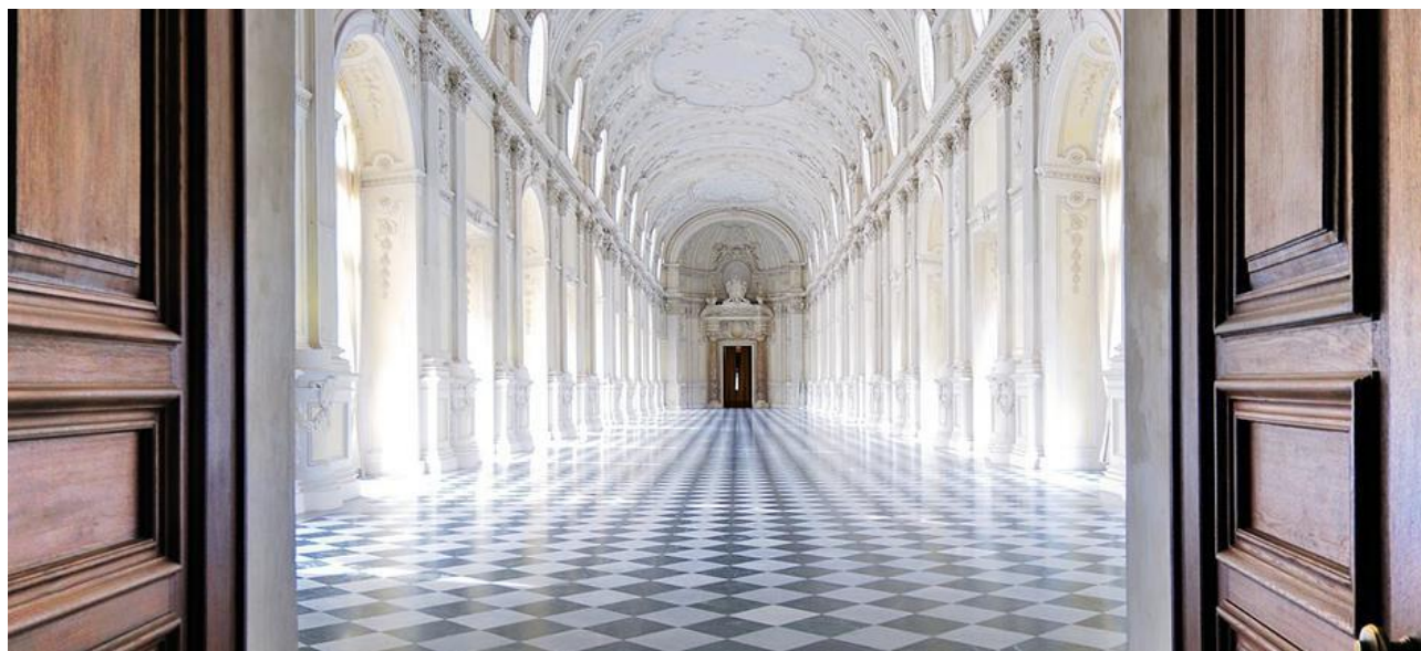
Reggia di Venaria

Our itinerary will start with the splendid Turin where we will be able to visit, savor, taste and be completely absorbed by the trendy and lounge atmosphere of this magnificent city. On the second day optional excursion to discover the wonders of the Reggia di Venaria.