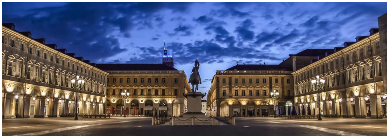
San Carlo Square in Turin