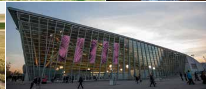
▲ Oval Lingotto, Torino