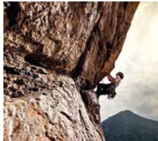
◀ Climbing on Cuneo Alps