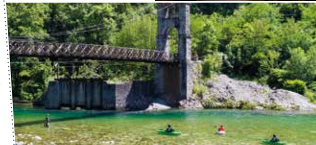
Broletto, Novara ▶