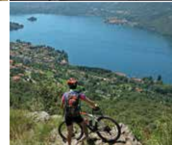
◀ Lake Orta view from Mount Crabbia